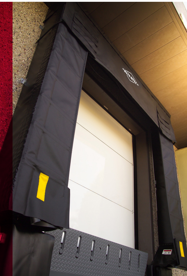
Rite-Hite® ComboShelter Enclosure.