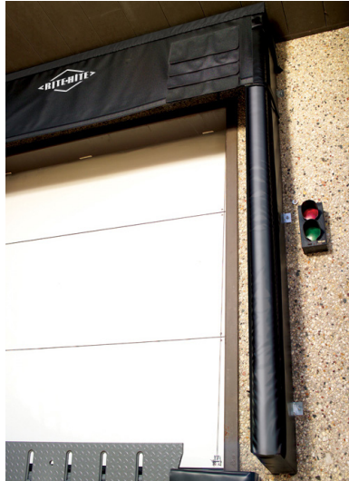
6"-wide (152 mm) side frames allow shelter to fit into narrow spaces.