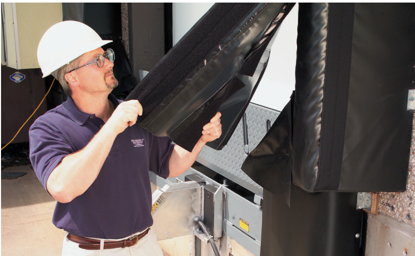
Removable side curtains allow for maintenance flexibility.