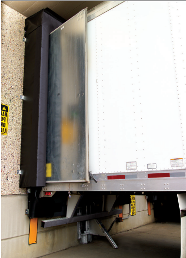
ComboShelter side frames are impactable for long-term durability.