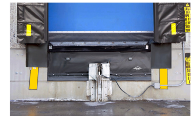
PitMaster Under-leveler Seal.

Rite-Hite®, ComboShelter™, and PitMaster™ are trademarks of Rite-Hite Holding Corporation. Rite-Hite products are covered by one or more U.S. patents with other U.S. and foreign patents pending. The information herein is provided as a general reference only regarding the use of the applicable products. The specifications stated here are subject to change.